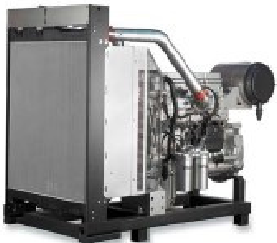
Perkins heavy duty high performance industrial type diesel engine.