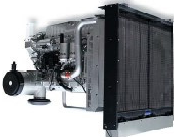
Perkins heavy duty high performance industrial type diesel engine.